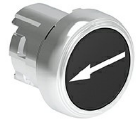
Pushbutton actuators, spring return, with symbol LPSB11