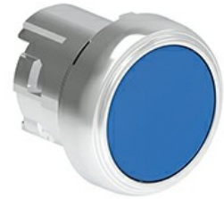
Pushbutton actuator, spring return LPSB10