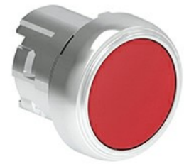
Pushbutton actuator, spring return LPSB10