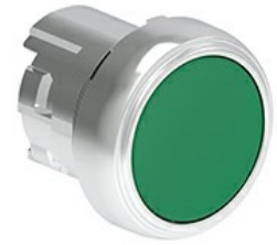
Pushbutton actuator, spring return LPSB10