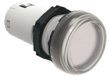
LED integrated monoblock pilot lights steady light LPML