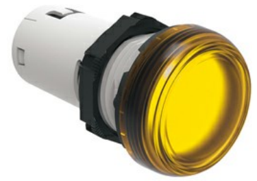
LED integrated monoblock pilot lights steady light LPML