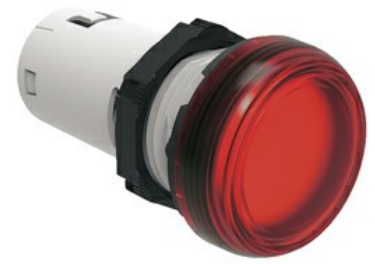
LED integrated monoblock pilot lights steady light LPML