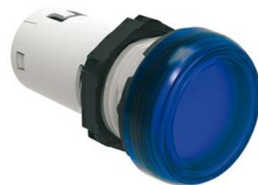
LED integrated monoblock pilot lights steady light LPML