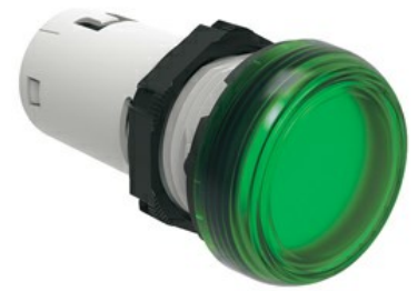
LED integrated monoblock pilot lights steady light LPML