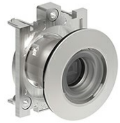
Spring return actuator without cap LPFXB0