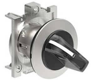
Illuminated selector switch actuator - 3 position LPFSL13