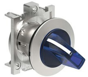
Illuminated selector switch actuator - 3 position LPFSL13