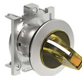
Illuminated selector switch actuator - 3 position LPFSL13