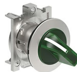
Illuminated selector switch actuator - 3 position LPFSL13