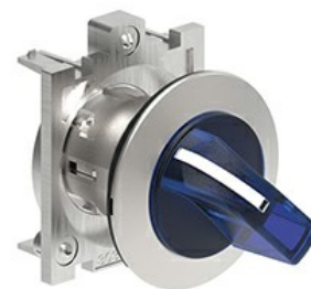
Illuminated selector switch actuator - 3 position LPFSL13