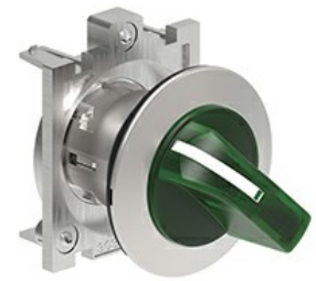
Illuminated selector switch actuator - 3 position LPFSL13