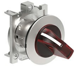
Illuminated selector switch actuator - 3 position LPFSL13