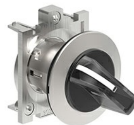
Illuminated selector switch actuator - 3 position LPFSL13