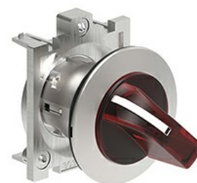
Illuminated selector switch actuator - 2 position LPFSL12