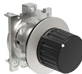
Selector switch actuator knob - 2 position LPFS42