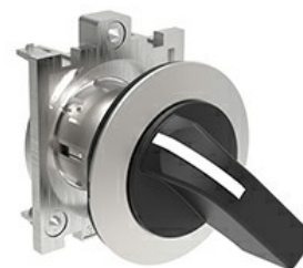
Selector switch actuators long lever - 3 position LPFS23