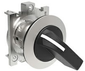
Selector switch actuators long lever - 2 position LPFS22