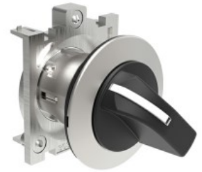
Selector switch actuators lever - 3 position LPFS13