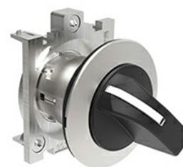
Selector switch actuators lever - 2 position LPFS12