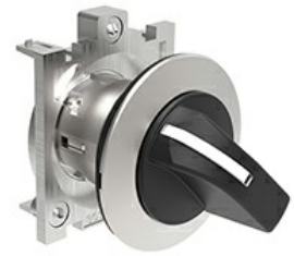
Selector switch actuators lever - 2 position LPFS12