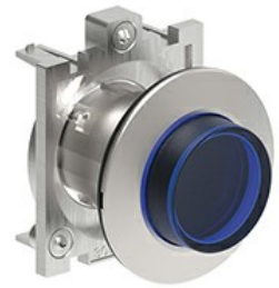
Illuminated push-push button actuators - Extended LPFQL20