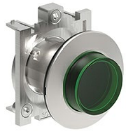
Illuminated push- push button actuators - Extended LPFQL20