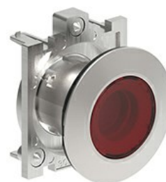
Illuminated push-push button actuators - Flush LPFQL10