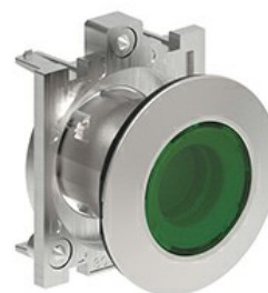
Illuminated push-push button actuators - Flush LPFQL10