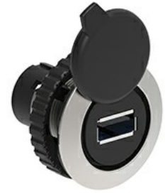
USB interface, A/B female type connection LPFD0