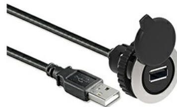
USB interface, A/A female type connection with 0.5m long cable LPFD0