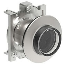
Illuminated button actuators, spring return - Extended LPFBL20