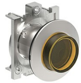
Illuminated button actuators, spring return - Extended LPFBL20