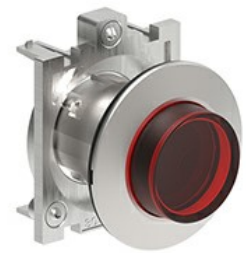
Illuminated button actuators, spring return - Extended LPFBL20