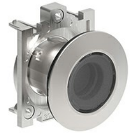
Illuminated button actuators, spring return - Flush LPFBL10