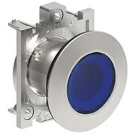
Illuminated button actuators, spring return - Flush LPFBL10