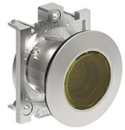
Illuminated button actuators, spring return - Flush LPFBL10