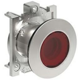
Illuminated button actuators, spring return - Flush LPFBL10