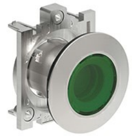
Illuminated button actuators, spring return - Flush LPFBL10