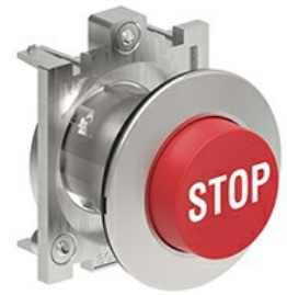
Pushbutton actuators, spring return, with symbol LPFB21