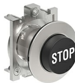
Pushbutton actuators, spring return, with symbol LPFB21