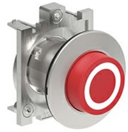
Pushbutton actuators, spring return, with symbol LPFB21