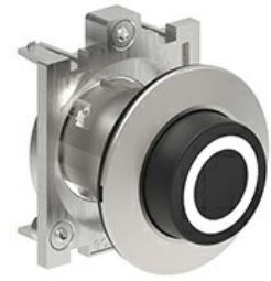
Pushbutton actuators, spring return, with symbol LPFB21