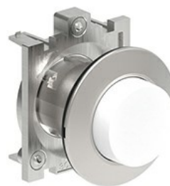
Pushbutton actuator, spring return LPFB20