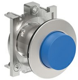
Pushbutton actuator, spring return LPFB20