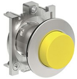
Pushbutton actuator, spring return LPFB20