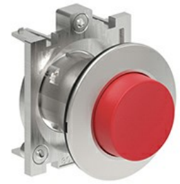
Pushbutton actuator, spring return LPFB20