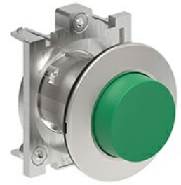
Pushbutton actuator, spring return LPFB20