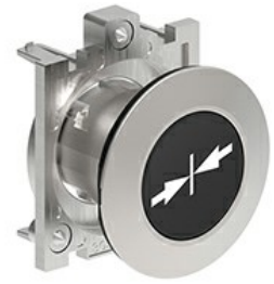
Pushbutton actuators, spring return, with symbol LPFB15