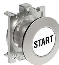
Pushbutton actuators, spring return, with symbol LPFB11